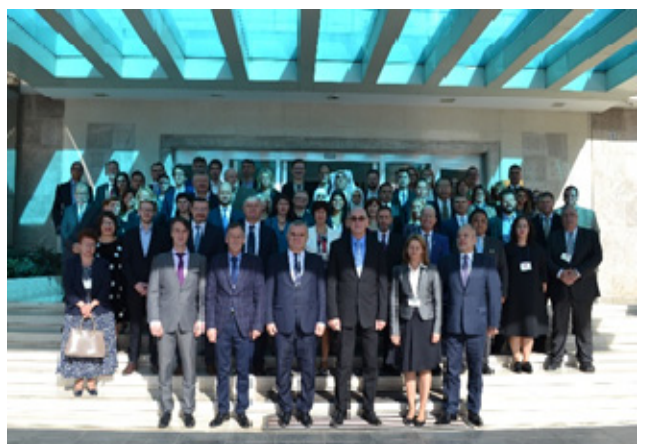
Group photo from the 15th EUROSAI WGEA Annual Meeting

All materials from EUROSAI WGEA meetings are available on the website, <a href="https://www.eurosaiwgea.org">www.eurosaiwgea.org</a>.