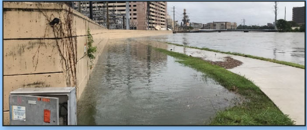
Substation floodwall during Hurricane Harvey