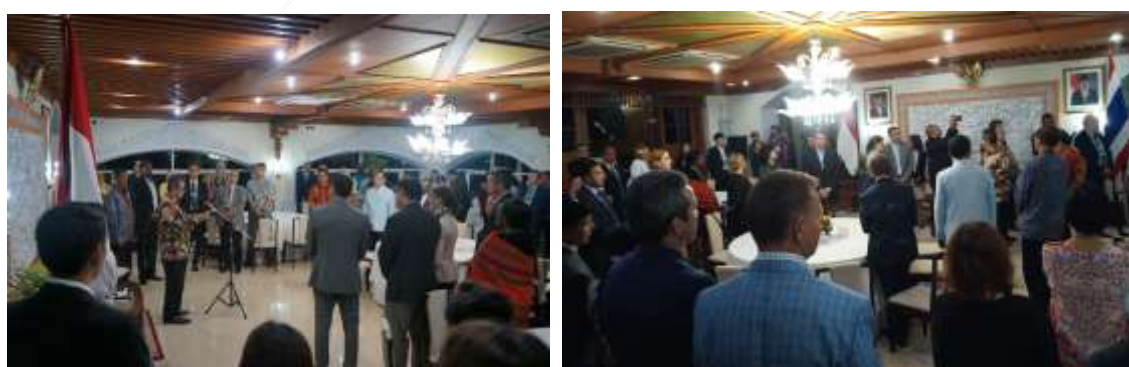
The participants at the Official Dinner hosted by SAI of Indonesia

The dinner hosted by SAI of Indonesia took place at the Indonesian Embassy Residence at Petchburi Road Ratchatewi, Bangkok 10400 Thailand . The participants had the opportunity to enjoy some of Indonesian cuisines.