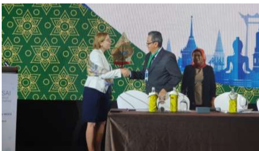
Passing the Baton of INTOSAI WGEA Chairmanship