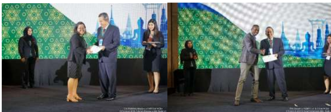
Greening SAs Training Participants receiving their certificates