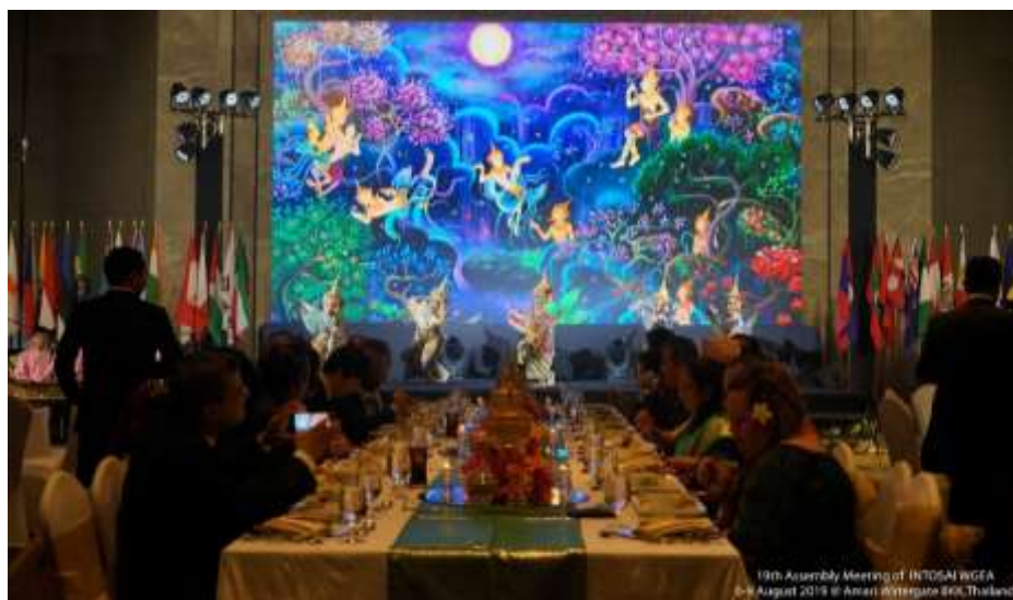
Official Dinner hosted by SAO Kingdom of Thailand – Amari Watergate Bangkok

SAO of Kingdom of Thailand represented by General Chanathap Indamra welcomed all the meeting participants in a cultural dinner hosted in the Amari Watergate Hotel in Bangkok.