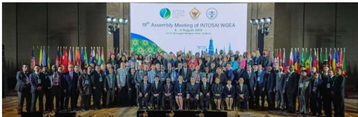
WG19 Participants Group Photo

in improving the environmental auditing capacities worldwide and continue to be the part of the solution.