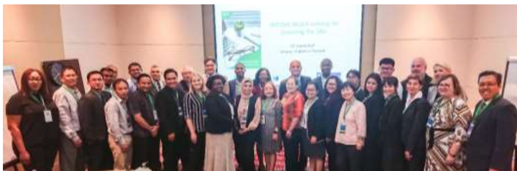
Greening SAIs Training Participants

The training mainly focused on how to start greening activities at the office level and what are the easiest and common greening activities to implement. There were 9 main sessions in the one-day training which include the introduction of what is greening, how to start it, how to implement it, and continuously improve it. By the end of the training, the participants were expected to understand the principles of greening office and could initiate the greening activities within their respective SAIs.