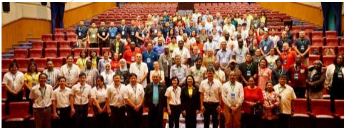
WG19 Participants at the PTT Global Chemical, Rayong Province - Thailand

SAI of Thailand invited the meeting participants to visit the PTT Global Chemical at Rayong Province in Thailand. PTT Global Chemical is a multinational company that has major concern on sustainable development. The company representative shared their experience on implementing the circular economy concept to reduce the negative impacts to the environment and other practices in preserving their surrounding environment and supporting local communities through a program called “Biodiversity Restoration Project”. Lastly, they highlighted that collaboration, networking, and support from local community are the key success of preserving the environment.