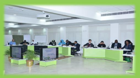
Training Hall - "Aravali"

Meeting Rooms, Auditorium for 175 persons, Rooms for Research Associates and Wi-Fi enabled campus.