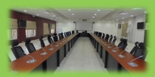
Training Hall - "Saraswati"